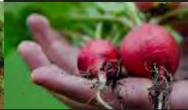
PURPLE TOP TURNIPS